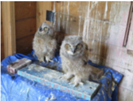
Submitted by Sandy Goodspeed